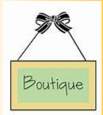
Table are $35 for members and $40 for non-members, plus 10% of sales for the two days. You can also rent ½ a table or share one with a friend. You do not have to be present to have a table or a resale license. We sell all kinds of hand crafted items beside painted ones. If it is painted, please finish the back with paint or stain. Start now and you will have a wonderful table. If you have questions, please contact Jeannetta or Becky