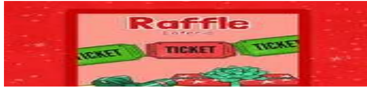
Holiday Raffle 2018