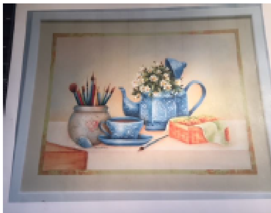
Artist Still Life - Saturday Class 12 x 16 canvas or surface of your choice