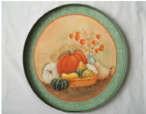
Fall Harvest Still Life -- Friday Class 17" Floor Cloth, serving tray or Ikea metal table (Gladom)